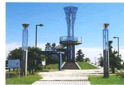
6 水郷の塔 豊かな水と緑に恵まれた弥富市のシンボルです。 Monument of the Riverside City A symbol of Yatomi City blessed with abundant water and greenery.