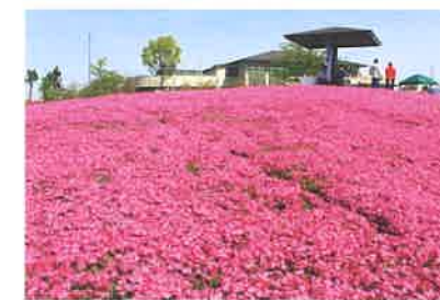
11 三ツ又池公園 4月中旬～下旬にかけて芝桜が咲き誇ります。 Mitsumataike Park Shibazakuras (ground pink) are in full bloom from mid to late April.