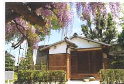
9 森津の藤(市指定文化財) 弥富出身の漢詩人 服部撫風の使用していた書斎「読亭」と藤の花が楽しめます。 Morizu no Fuji (Wisteria of Morizu) (cultural property designated by Yatomi City) The main features are the study room "Rantei" used by Tanpu Hattori, known as a Chinese-style poet from Yatomi, and the flowers of wisteria.