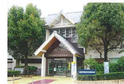
5 歴史民俗資料館 22品種の金魚を展示しています。 Museum of History and Folklore Exhibiting 22 varieties of ornamental goldfish.