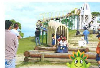
10 海南こどもの国 約11ヘクタールの広大な敷地でアスレチックやスポーツを満喫できる施設です。 Kainan Kodomo-no-Kuni A children's park built on a vast area of approximately 11 hectares where children can enjoy the adventure playground, obstacle courses and other sports.