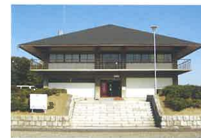
14 弥富野鳥園 季節によっていろいろな野鳥を観察できます。 Yatomi Wild Bird Park A variety of different wild birds can be observed each season.