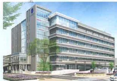
1 弥富市役所 ※建設中 Yatomi City Hall ※Under construction