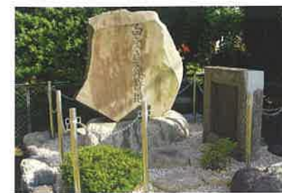
4 白文鳥発祥地碑 明治始めに桜文鳥から突然変異で「白文鳥」が誕生した地です。 Monument of the Birthplace of the White Java Sparrow The "white java sparrow" was born as a result of a mutation from the pied java sparrow.