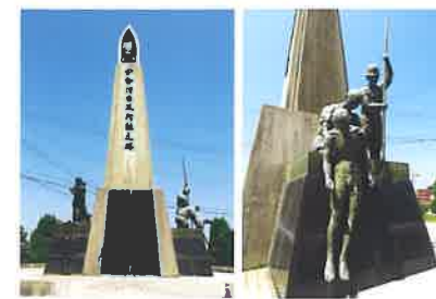
13 伊勢湾台風殉難之塔 伊勢湾台風の被災者の慰霊と災害の教訓を後世に伝えるため昭和38年に建設されました。 Monument for the Victims of the Isewan Typhoon The monument was built in 1963 in memory of the victims of the Isewan Typhoon and to hand down the lessons of the disaster to later generations.