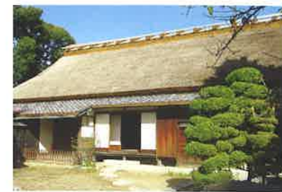
3 服部家住宅(国重要文化財) 天正年間に建てられた県内でも有数の古い民家。 The Hattori Residence (national important cultural property) Built in the late 1500s, one of the oldest houses in the prefecture.