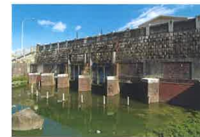
8 立田輪中人造堰樋門(市指定文化財) 明治時代に輪中の排水に苦慮した水利史の遺跡。 Tatsuta Polder Sluice Gates (cultural property designated by Yatomi City) The ruins are a reminder of the difficult history of draining water from the polders during the Meiji era.