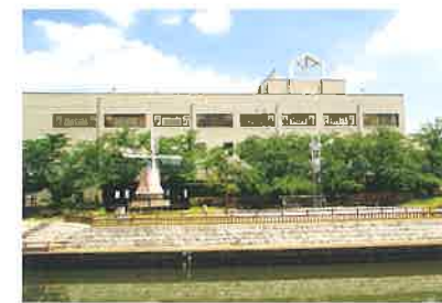
7 総合社会教育センター 4月上旬「やとみ春まつり」が開催され、桜の名所として市民に親しまれています。 Integrated Social Education Center "Yatomi Spring Festival" is held here in early April and the center is popular with citizens as a famous place for cherry blossoms.