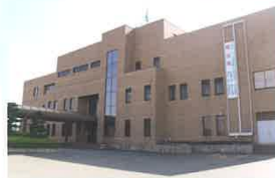
2 十四山支所 Jushiyama Branch Office